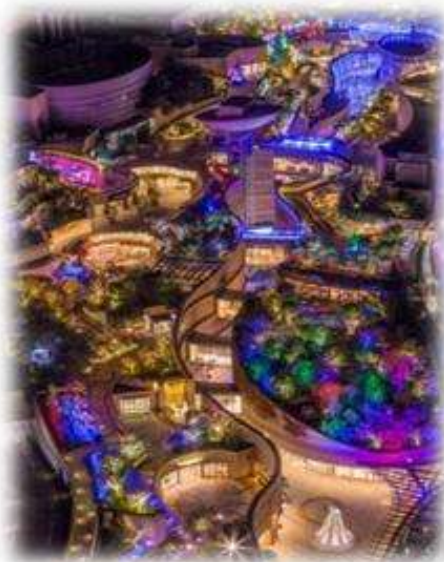
Namba Parks “Hikari forest” ※picture is from last year

For details of these facilities, please see below.