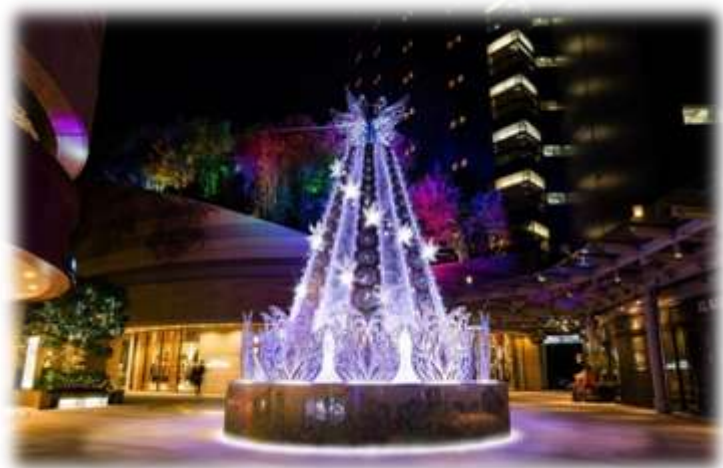
Objet “Hikari fairy” in Namba