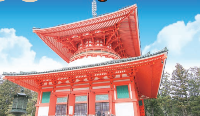
World heritage Koyasan Kudoyama course