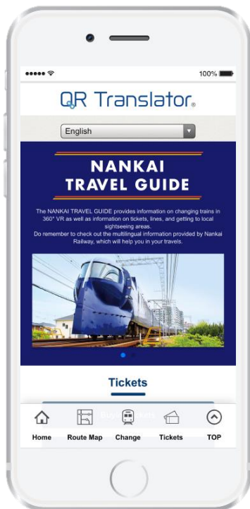
“NANKAI TRAVEL GUIDE” (English)

We will introduce new technologies for passengers to enjoy the ride on Nankai Railway, and for more convenient journey in Japan. Other details are on the next page.