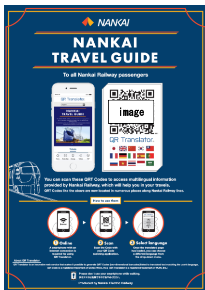
Poster with QR Code

【Stations with poster】 Namba, Shin-Imamiya, Tengachaya, Rinku-Town, Kansai Airport, Hashimoto