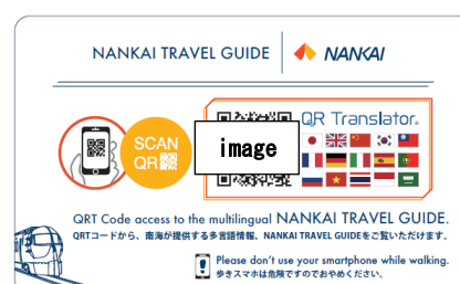
Card with QR Code