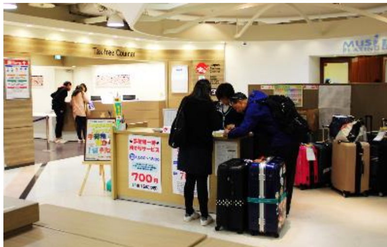
NAMBA CITY B2F Baggage Storage Counter

Nankai Electric Railway Co., Ltd. and YAMATO TRANSPORT CO., LTD. have been operating the baggage storage service at B2 Floor of NAMBA CITY since September, 2016. This service will keep operating after “nest” opens.