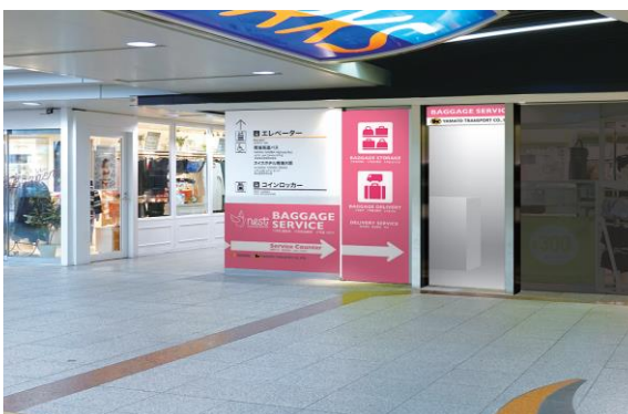
Image of the store

6. Consigned to YAMATO TRANSPORT CO., LTD.